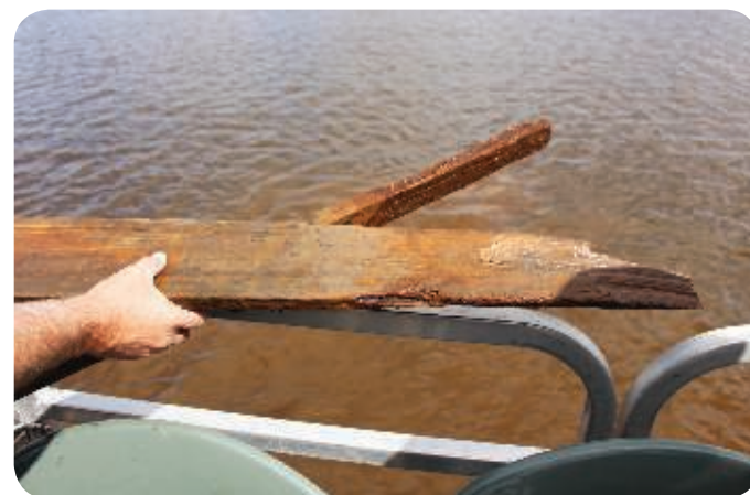
Restoring Grassy Point involves removing piles of scrap lumber left behind from Duluth sawmills over a century ago.

Construction is expected to be completed in December 2020, and Barr is currently providing construction administration, engineering, and quality control. For more information, contact Ben Meemken at 952-832-2986 or bmeemken@barr.com. ■