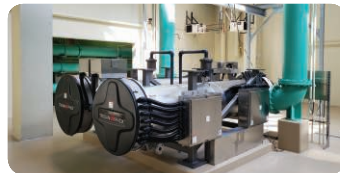
Barr provided engineering design and construction administration for the City of New Brighton's advanced oxidation process treatment system.