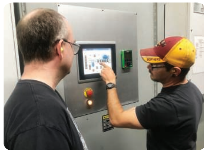
MDI employees monitor the drive and control panels that replaced four display panels and over 80 push buttons, improving reliability and efficiency.

engineering and EPCM services, contact Joe Vespa at 218.262.8622 or jvespa@barr.com . ■