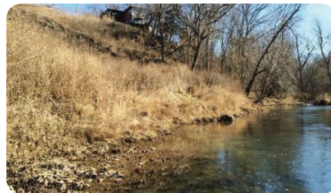
Barr provided engineering design and environmental support for a pipeline replacement traveling through a rocky subsurface and across a river that is home to a federally protected fish species.